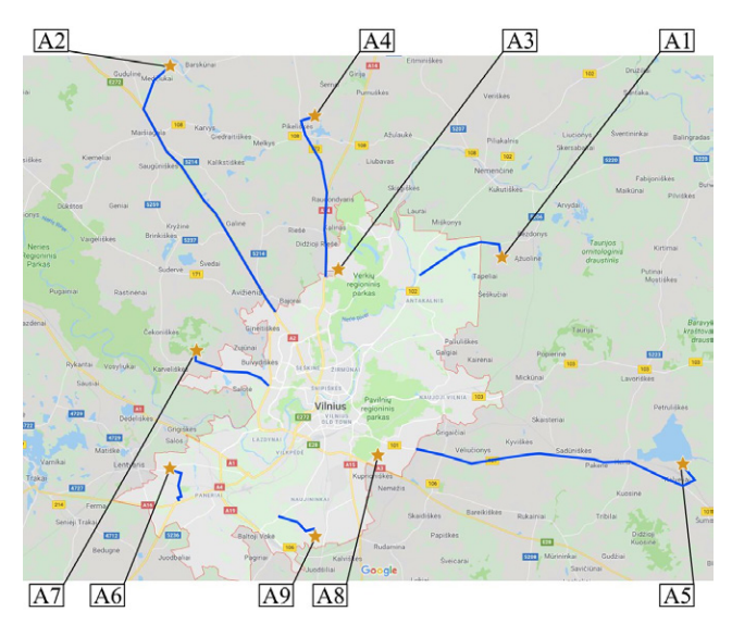
Figure 1. Chosen plots-alternatives in Vilnius city/suburb (The image is created according to an open data map, https://maps.lt)

Other possible criteria were considered, such as restrictions: trunk gas, high-voltage power lines or objects included in the general district plans. Because the vendors provide these aspects after reviewing the city or district master plans, they are not included in the list of criteria. It is practically impossible to predict the future infrastructure of a particular plot or the surrounding land, so the valuation was based on the data provided by the sellers. The "fuel cost" criterion was also considered but rejected as the customer's workplace is not covered by the study and may change. The decision was made to evaluate the