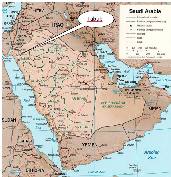
Fig. 1. Location of Tabuk region