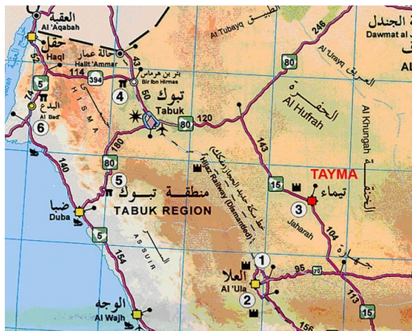
Fig. 2. Positioning of Tabuk city within the region

ents were asked to provide their opinions on alternative modes of transport and provide a rating of these modes in relation to a number of different criteria such as comfort, reliability cost travel time etc. This was aimed at determining how willing individuals to change their mode of transportation and what it is that would instigate the decision to change.